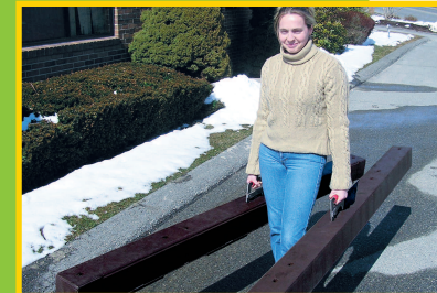
Carry two at once with our exclusive handles