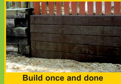
Build once and done